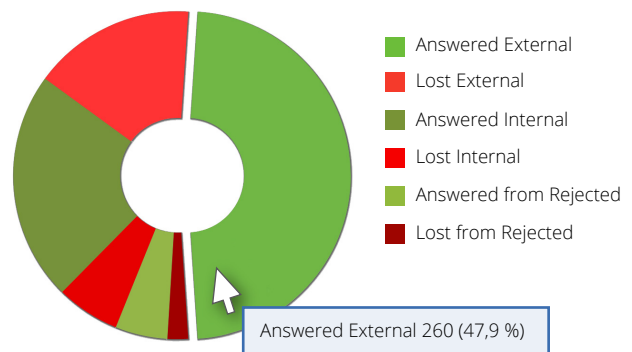
Fig. 1: Analyses „Hunt groups & Extensions“